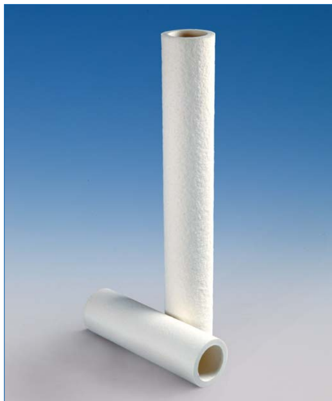
Profile Coreless Filter Element